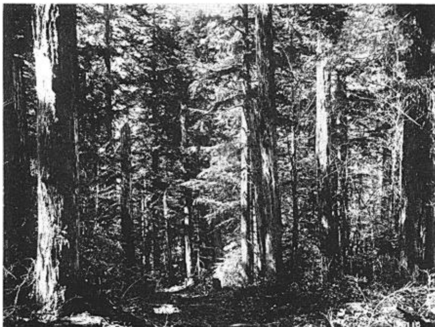
FIG. 1.—A stand in the Wind River Natural Area where overmature Douglas-fir is being replaced by western hemlock and Pacific silver fir.

2 Steele, Robert W. Wind River climatological data 1911-1950. U. S. Forest Service, Pacific Northwest Forest and Range Expt. Sta. 21 pp. 1952.